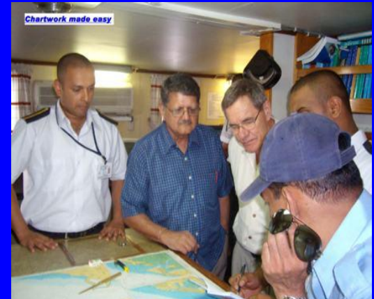
Chart work simplified ...