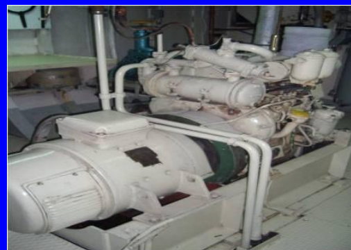
TYPE -DEUTZ, IN LINE, NATURAL ASP,SR.NO.-CMU20823, POWER-40 KW, 1500RPM, 3 CYLINDERS,DC GENERATOR