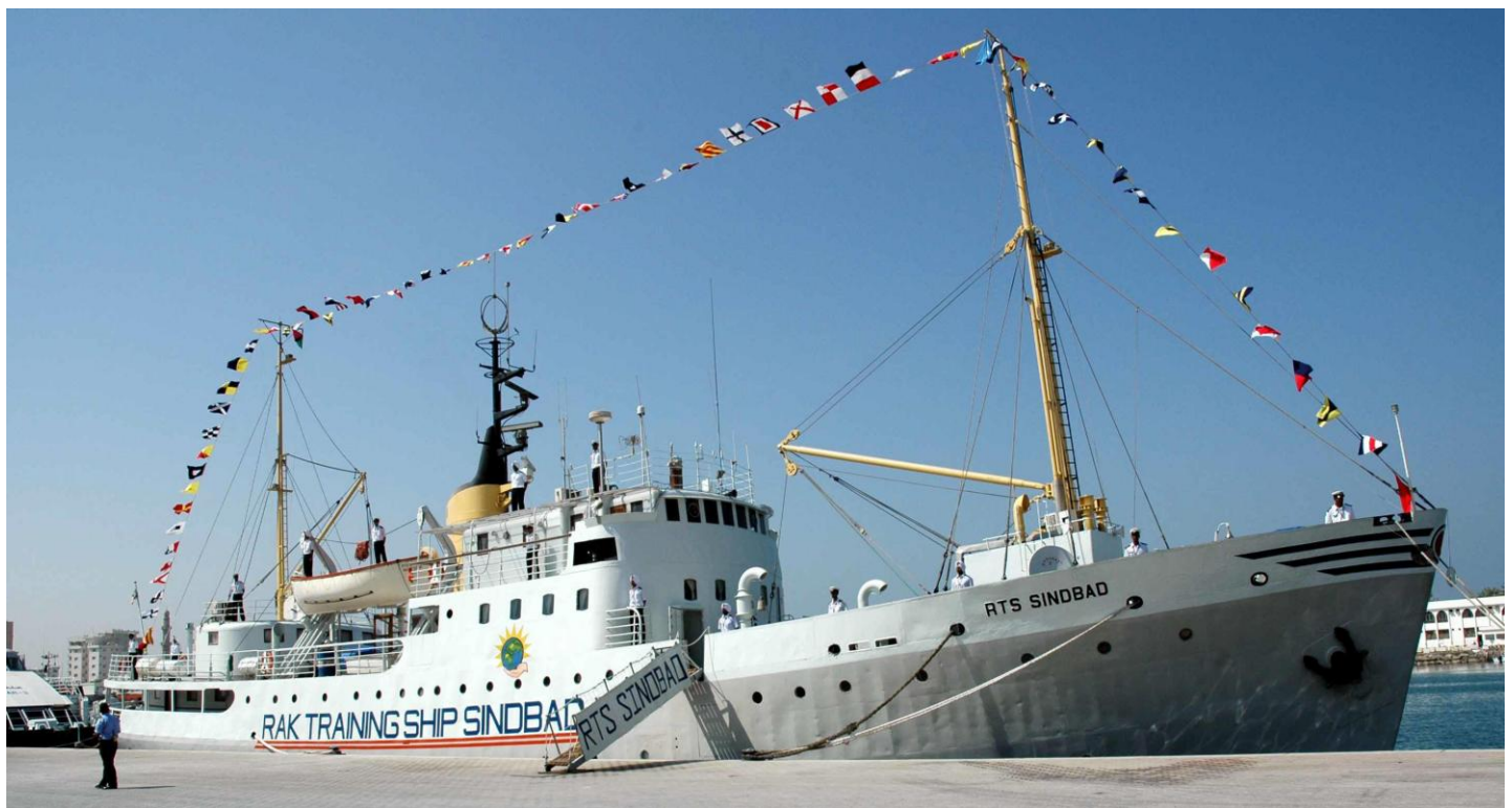
RAK TRAINING SHIP SINDBAD - The Floating University

WINNER OF "SAILOR TODAY" – INNOVATIVE MARITIME TRAINING AWARD (2006) FINALIST FOR "LLOYD'S LIST" – LONDON TRAINING AWARD (2007)