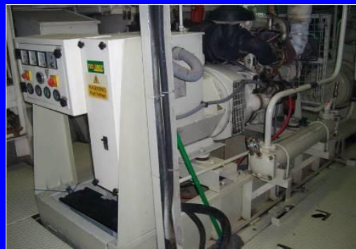
TYPE -PERKINS, IN LINE T/C,SR.NO.- ABU621103L, POWER-70.5 KW, 1500RPM, 4 CYLINDERS,, AC GENERATOR