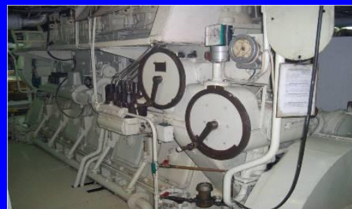
TYPE -NOHAB POLAR 2 STROKE, 900 BHP,5 CYLINDER, 300 RPM